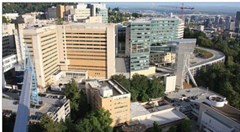
PORTLAND VA MEDICAL CENTER, Portland, Oreg.