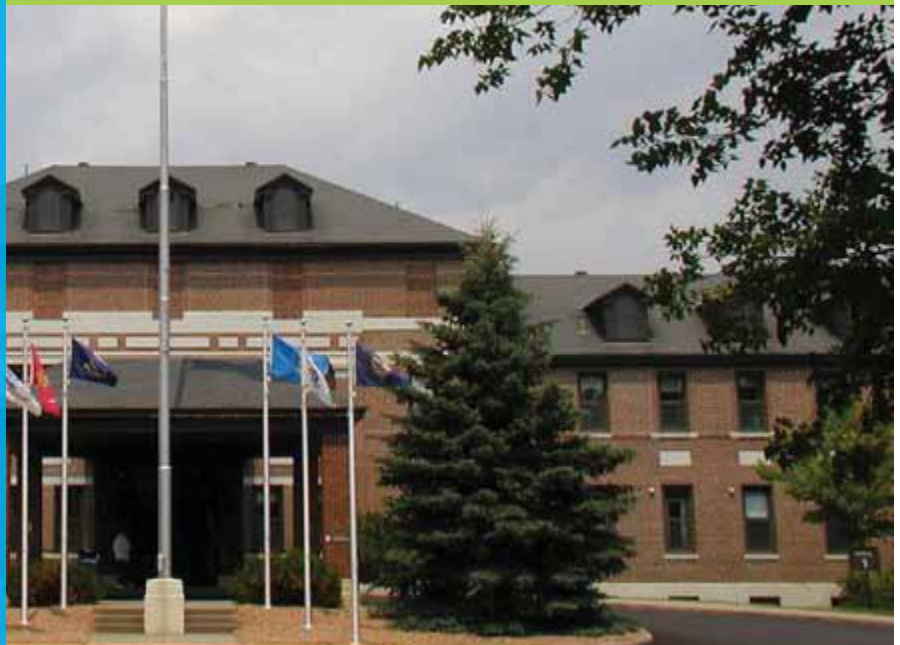
St. Cloud VA Health Care System Dietetics Building 4 | 4801 Veterans Drive, St Cloud, MN